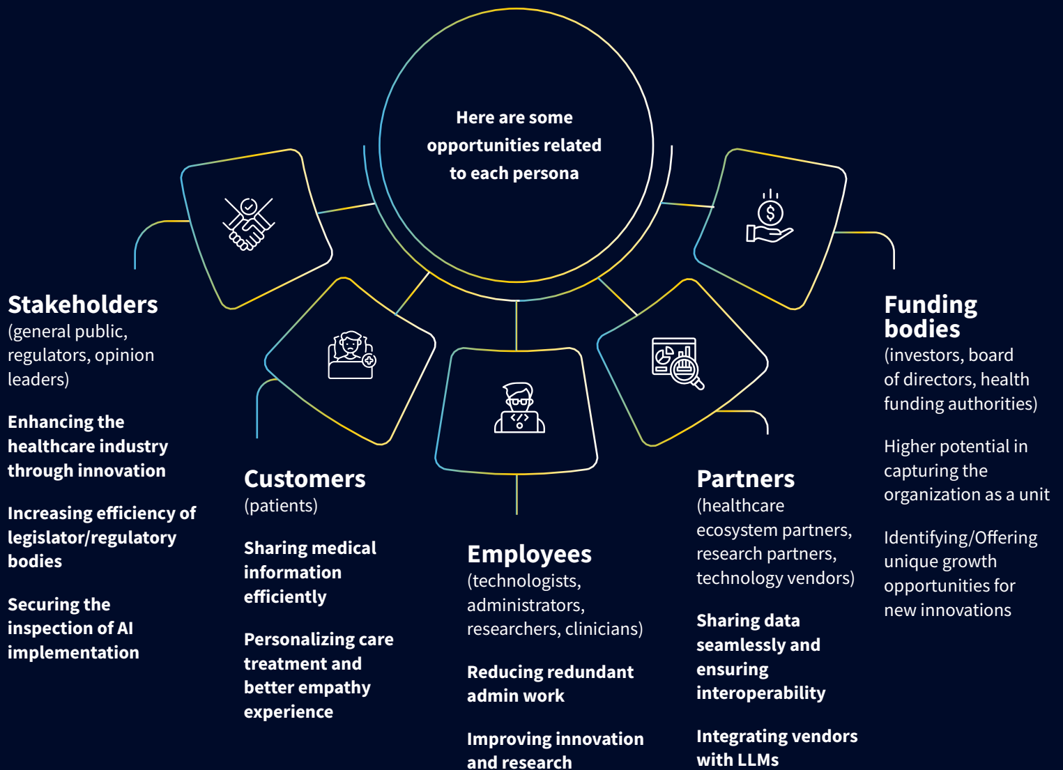
Figure 1: Opportunities to improve patient care persona-wise.

A specialized type of AI that can be trained with huge amounts of data to translate existing content and generate original content is termed a Large Language Model (LLM). In the healthcare industry, LLMs can help patients with clinical trials by mapping each trial's criteria with the patient's individual attributes mentioned in Electronic Health Records (EHR). LLM views in healthcare organizations can hold many industry opportunities.