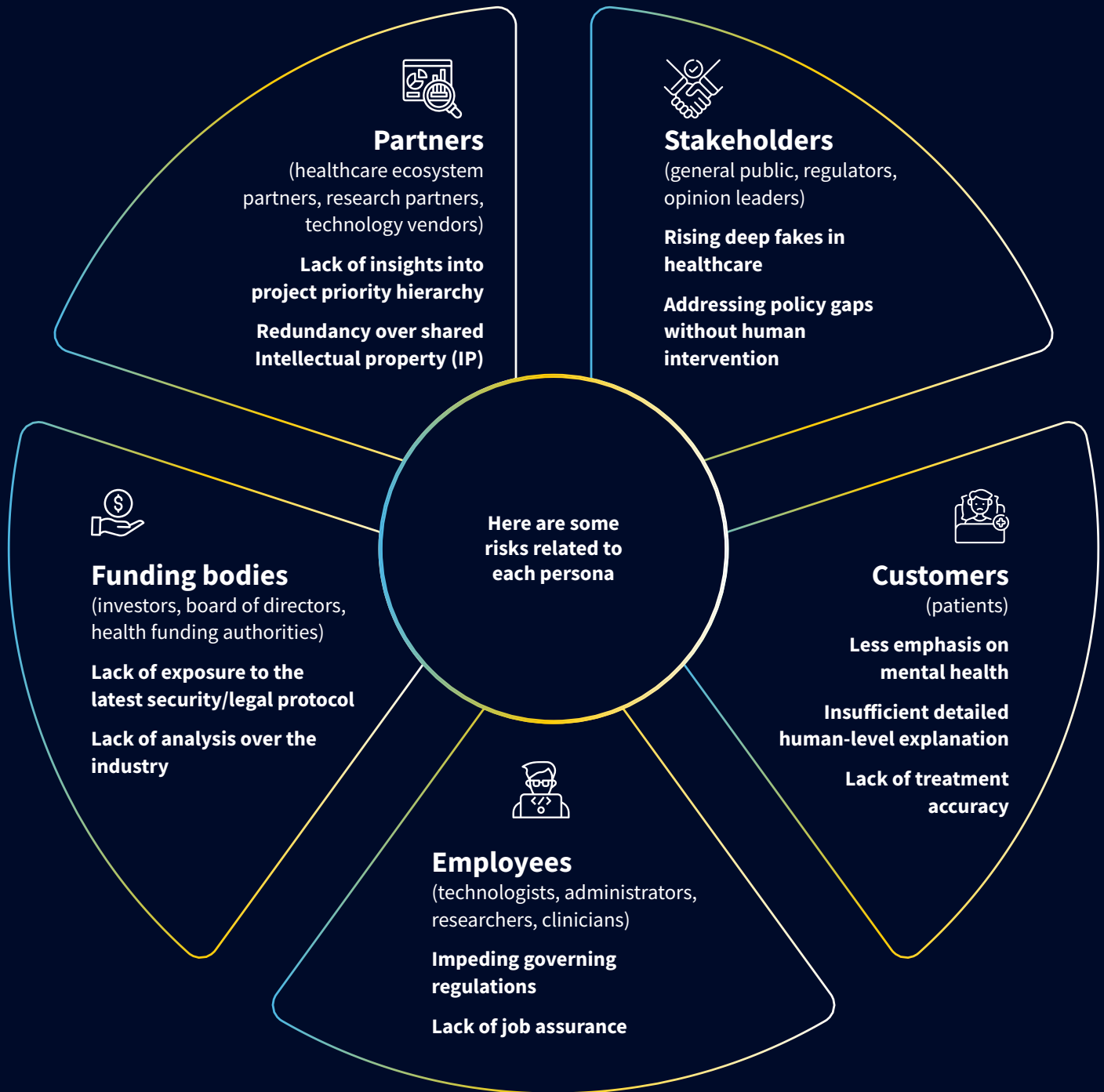
Figure 2: Risks of GenAI for each persona

Implementing GenAI in healthcare poses risks alongside opportunities.