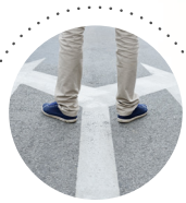
Fleet Health Monitoring