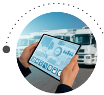
Digital Fleet Mapping