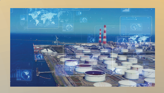
Custom Analytics & integrations