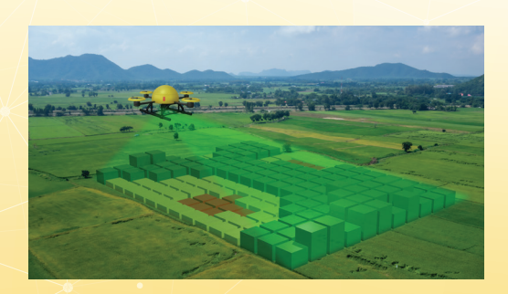
Spatial data collection services