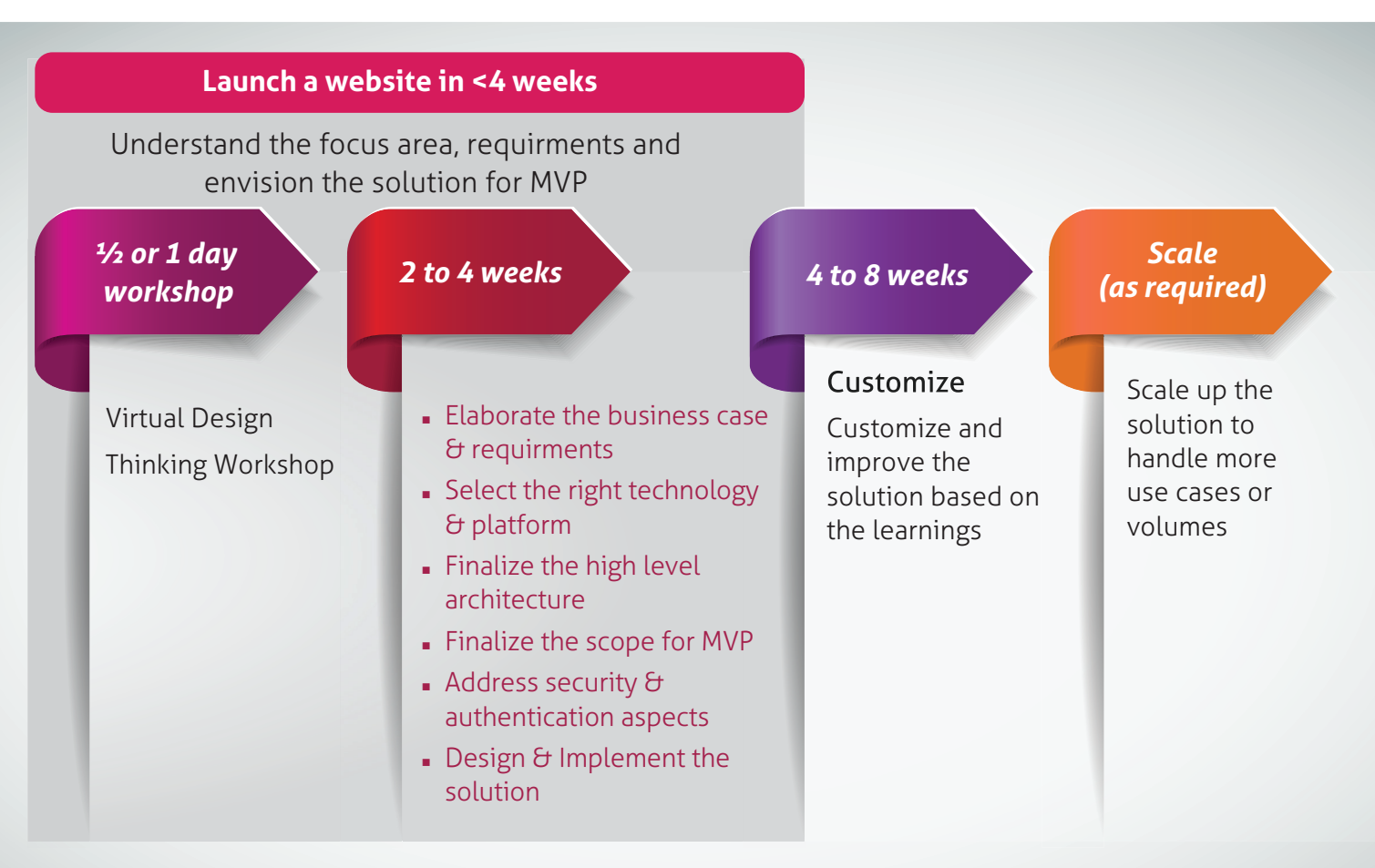
A high-level plan to launch website in < 4 weeks' time

Below is Mindtree's framework to help build a D2C website in less than 4 weeks.