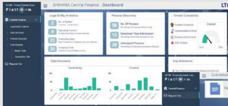
CFIN Transformation Platform: Main Dashboard

CFIN Transformation Platform: Comprehensive Report-Out with Technical Blueprint and Analysis Reports in PDF and Excel formats.