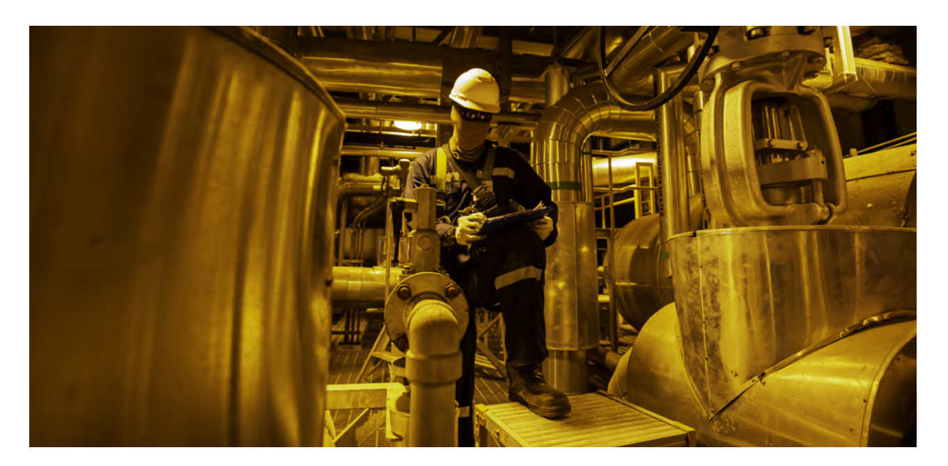
AI-ML Techniques help Reduce Seismic Interpretation Cycle Time 2

Interpretation of the acquired seismic data is the primary step and the backbone of the exploration campaign. Traditionally, experienced geoscientists spend months studying, analyzing, correlating, and interpreting seismic data to identify the hydrocarbon reserves. Specialized petro-technical application suites, such as Petrel, DSG, and Kingdom Suite, help seismic interpreters map horizons, faults, well-correlation, attribute analysis, and DHI studies. The final deliverables, after end-to-end interpretation, are drill-ready prospects along with the estimated in-place oil and gas volumes and the associated Geological Chance Factor (GCF). Typically, the turnaround time from seismic data acquisition to interpretation can extend to more than a year and a half. As exploration campaigns extend to geologically challenging areas where drilling of wells is extremely complex, there are continuous demands to increase the accuracy of interpretation and at the same time reduce the time to "first oil" through faster seismic interpretation processes.